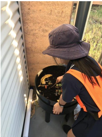
Feeding the worms