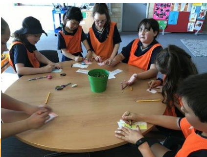
Shelf markers activity.