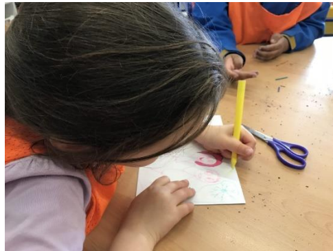
Father's Day cards