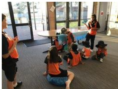
Paper plate animal making and puppet show.